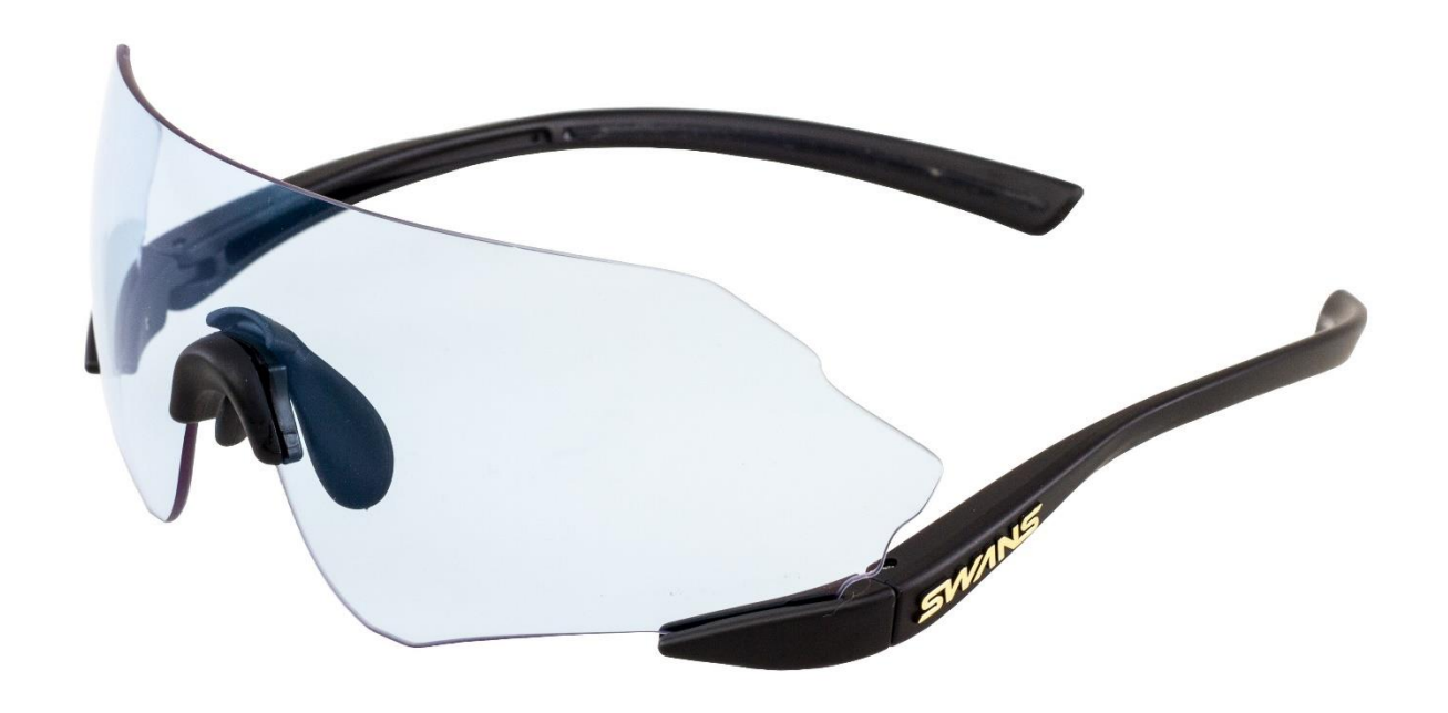
The E-NOX NEURON20 worn by Jun Mizutani at the Tokyo Olympic Games.

"We would like to continue collaborating with small and medium-sized venture companies that have technological capabilities and unique materials. Let's work together to liven up the Japanese sports scene!" -The company's challenges will continue as it prepares for the Paris Olympic Games in 2024.