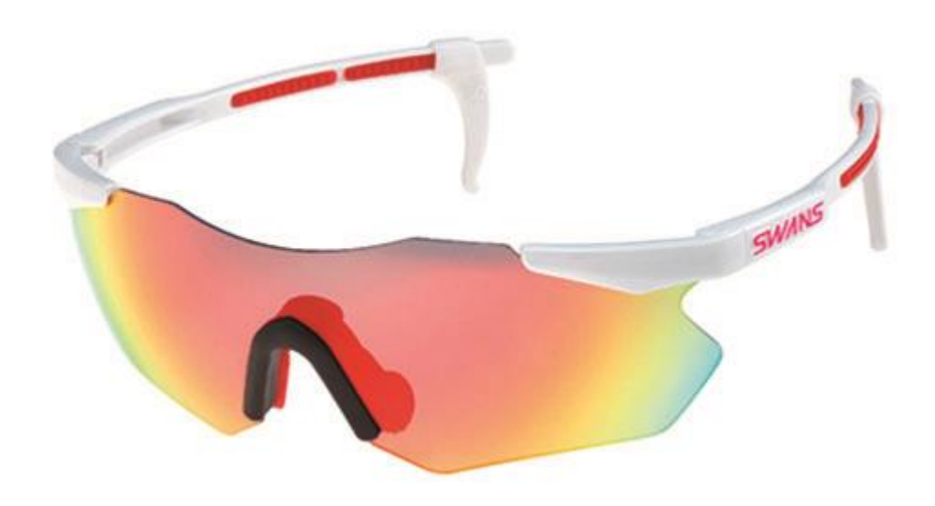
The model worn by Yuko Arimori

The catalyst for their popularization was the 1992 Barcelona Olympics. When Yuko Arimori won the silver medal in the women's marathon, she was wearing sunglasses, which generated a lot of interest.